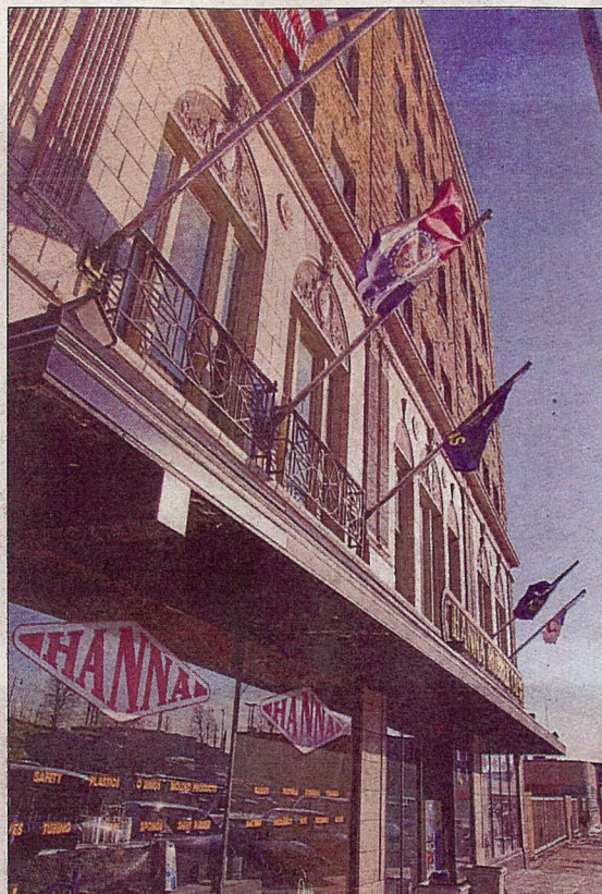
Hanna Rubber Co. has been at 15th and Baltimore since 1992, but the company has been in business since 1925.